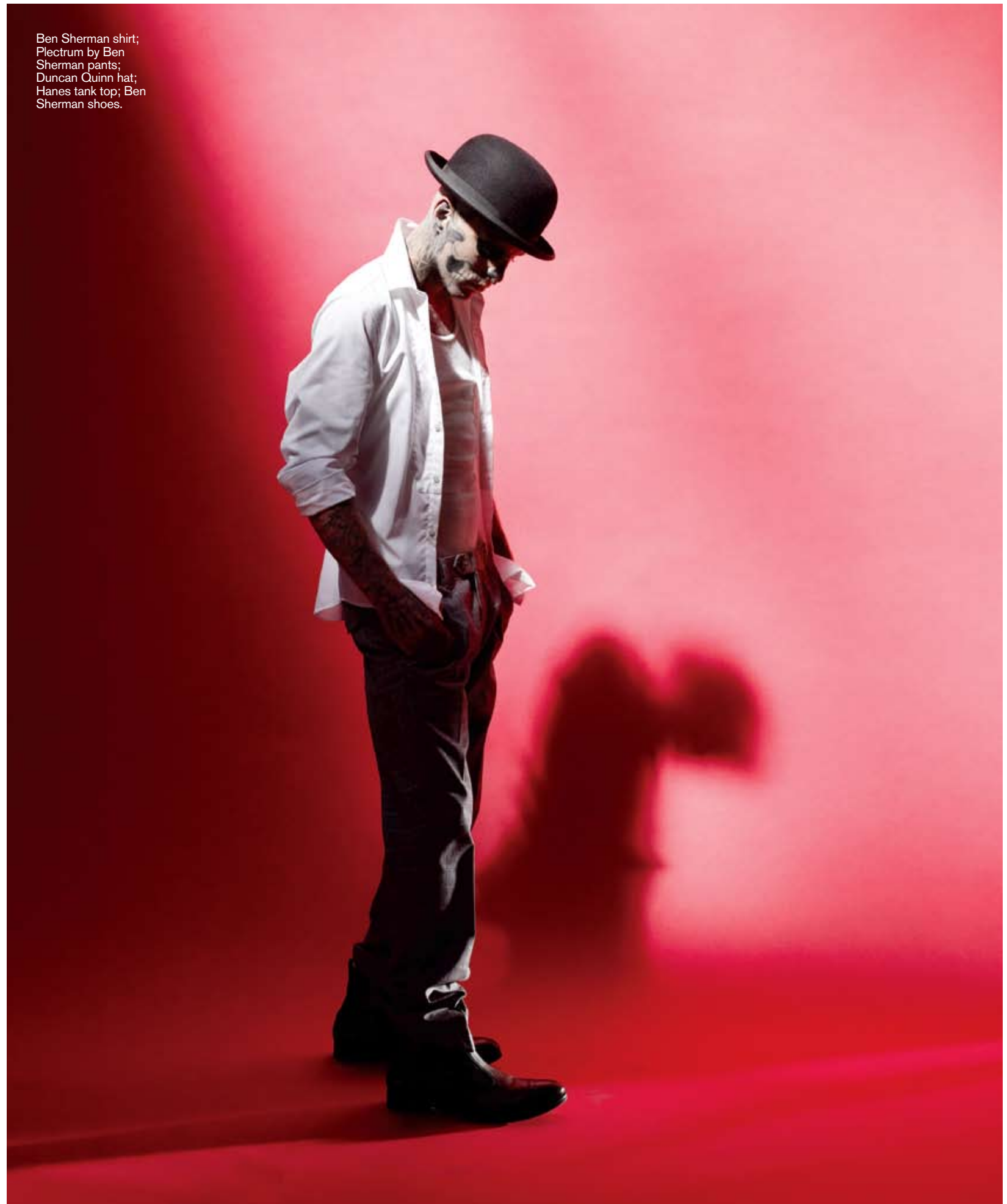
Ben Sherman shirt; Plectrum by Ben Sherman pants; Duncan Quinn hat; Hanes tank top; Ben Sherman shoes.