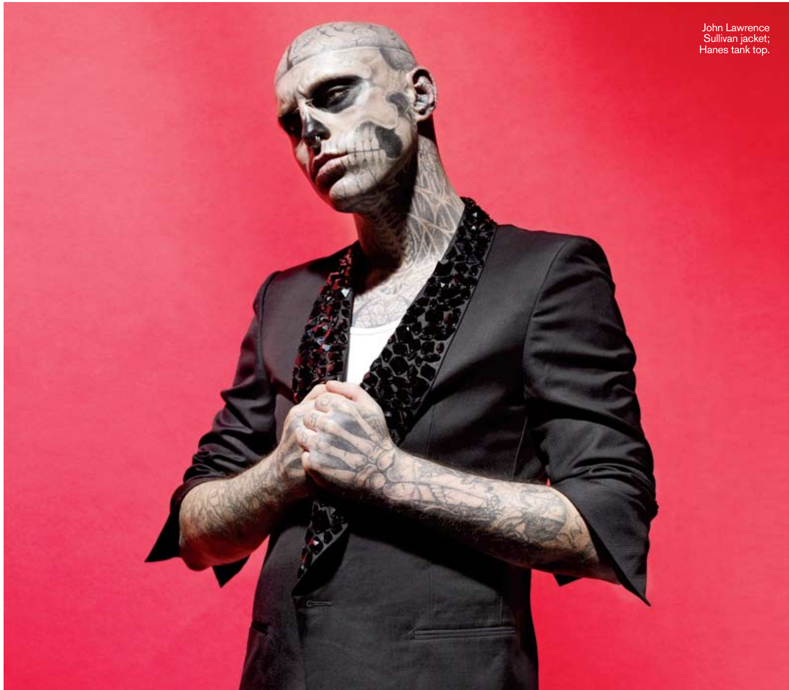
John Lawrence Sullivan jacket; Hanes tank top.

Tattooing oneself from head to toe to look like a rotting corpse is not the traditional route to stardom, but it has somehow worked out for Rick Genest, a.k.a. Zombie Boy.