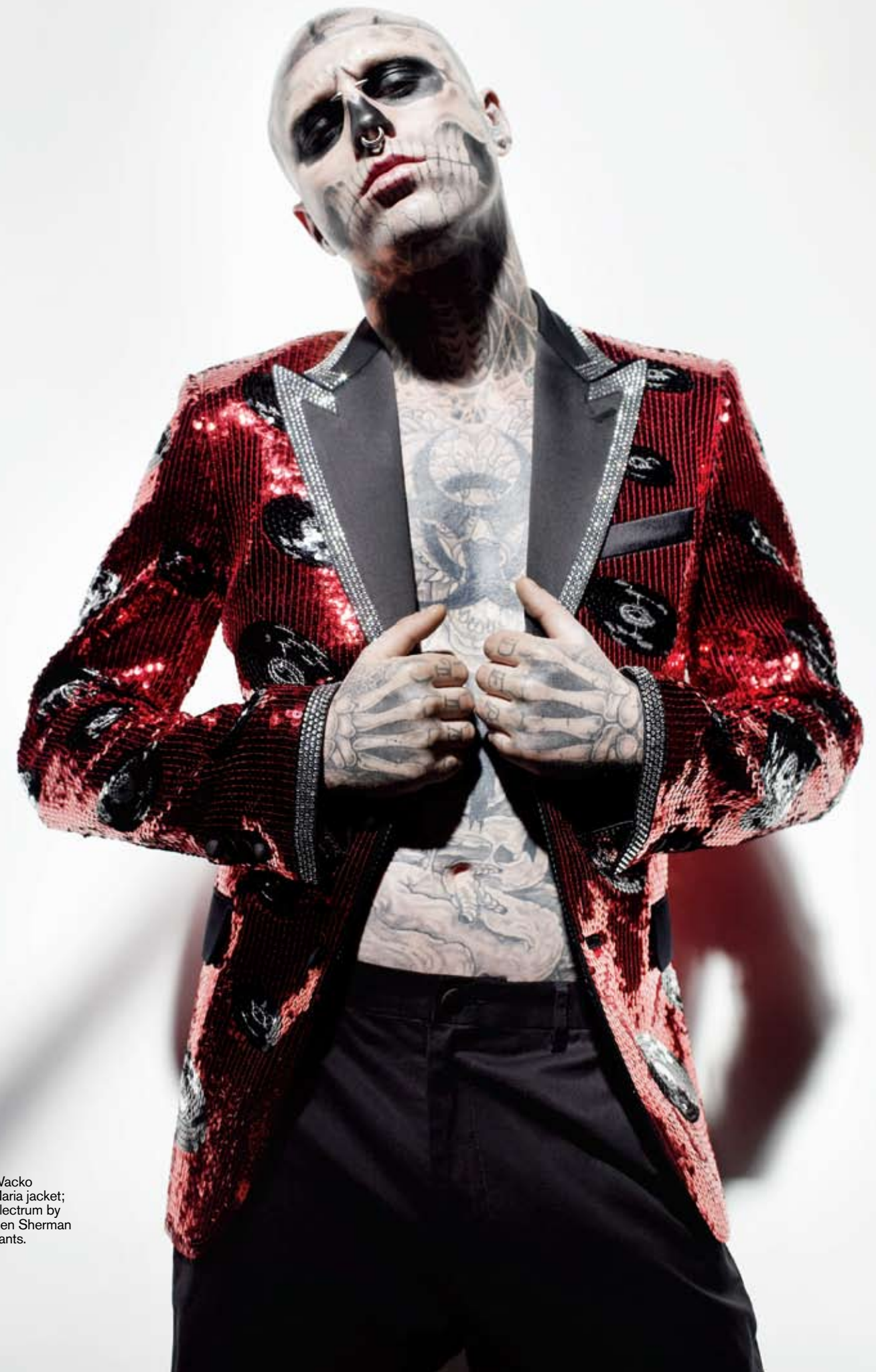
Wacko Maria jacket; Plectrum by Ben Sherman pants.