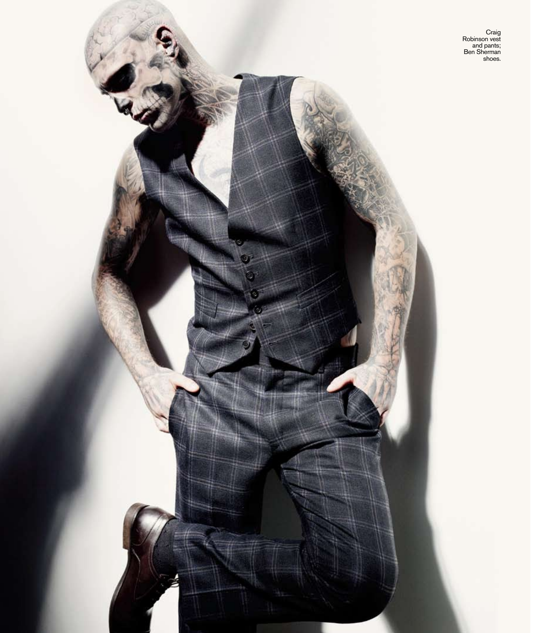
Craig Robinson vest and pants; Ben Sherman shoes.